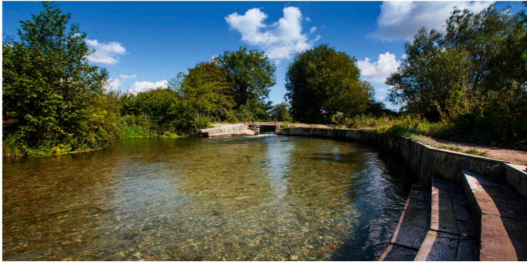
Compton Lock on the Itchen Navigation is a popular wild swimming and paddling spot for families